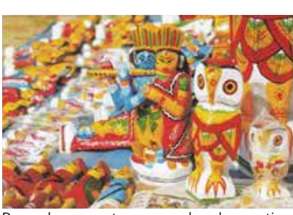
Bengal are toys and decorative panels. Folk motifs are used to give the products an earthy appeal.

West Bengal is famous for wood craft made from the wood of the coconut tree. The traditional wood carvers of West Bengal continue to use the simplest of tools and follow the styles that have been handed down through the generations. This has helped the craft to maintain a high standard of perfection.